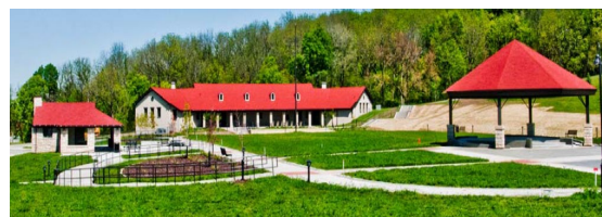
Pool Pavilion: Once the third-largest pool complex in the world, the pool pavilion is used primarily as classroom space for multi-purpose training or instruction. Available to public for rent. The building comes with 25 tables and 175 chairs. (Max. Cap. 200)