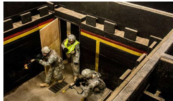
Live-Fire Shoot House: Firing ranges that are set up to simulate a residential or commercial environment that can train law enforcement or military agencies in several combat scenarios. Participants use live fire weapons with the walls built to absorb the rounds fired.