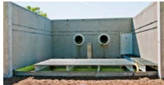
Leadership Reaction Course: The course is a series of team problems requiring problem-solving skills, teamwork, and physical ability which helps Soldiers hone their self-confidence and discipline.