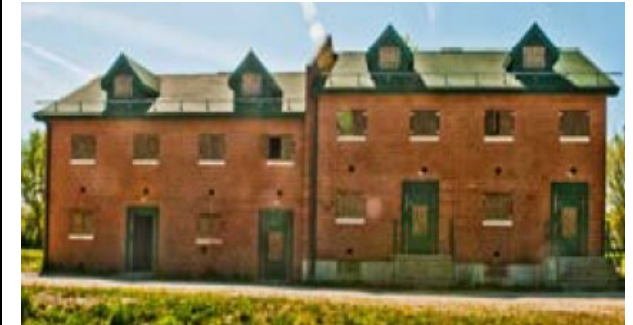
Military Operations on Urban Terrain (MOUT): Defined as all military actions that are planned and conducted on terrain where man-made construction affects the tactical options available to the command.