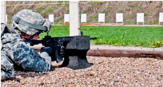
Small Arms Range: Used for zeroing and qualification of all individual weapons, including rifles, shotguns, and pistols.